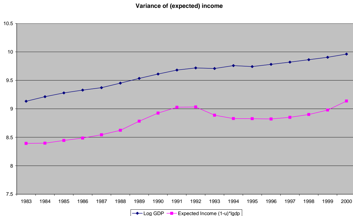
Figure 3.3 Variance of expected income and income

Second, the return to the relatively low rates of migration of the 1980's is not worrying as such, what matters is whether the rate of migration is low despite high incentives to migrate. Figure 3.3 presents some indicators of the incentives to migrate. The upper line in the figure depicts the variance of the log of per capita GDP. The slight increase indicates that the regions in our sample have not converged in the period under consideration (see, for a similar finding, Barro and Sala-i-Martin, 1991).