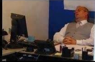
What my boss thinks I do