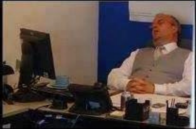
What my parents think I do