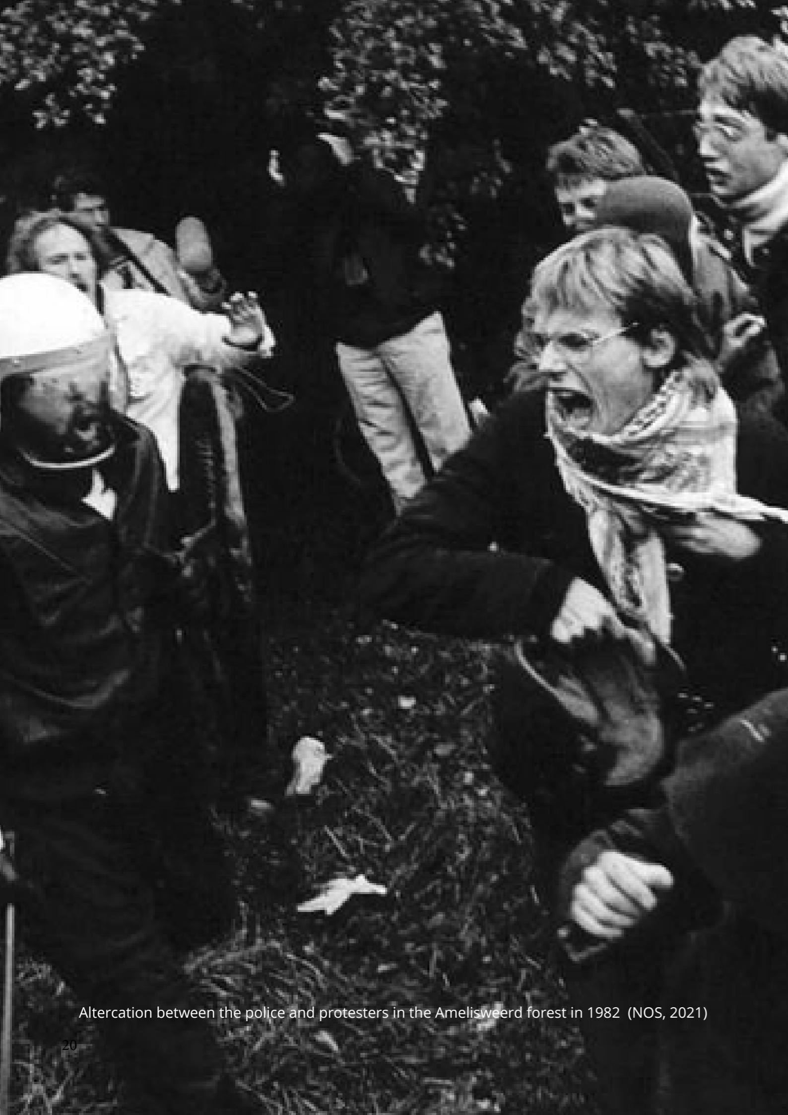
Altercation between the police and protesters in the Amelisweerd forest in 1982