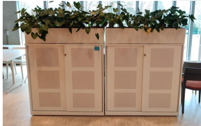
Figure 3 & 4: Cabinets with learning tools

To open these cabinets you will need a key that can be retrieved from the lockbox at the entrance of the Learning Plaza.