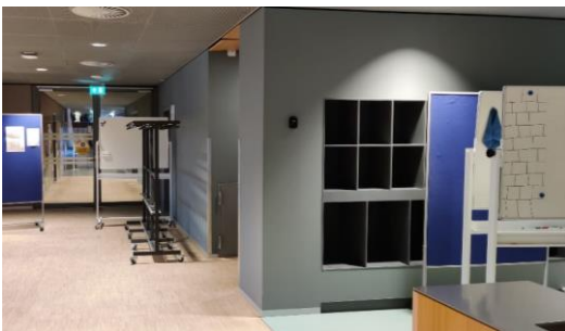
Figure 5: The red circle shows the lockbox in the Learning Plaza

To open these cabinets you will need a key that can be retrieved from the lockbox at the entrance of the Learning Plaza.