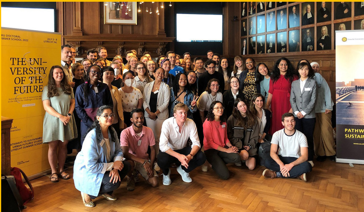
Photo: LERU doctoral Summer School

In 2022, the EWUU Alliance actively contributed to the organisation of five challenges focused on sustainability: Replacing Animal Testing (RAT), Dutch Dairy Challenge (DDC), Inter-university Sustainability Challenge, Regenerative City Challenge, and the Bio-Tech-Med Nutrition Interdisciplinary Team Training challenge (BITT). All challenges were open to students from the partner institutes: Eindhoven University of Technology, Wageningen