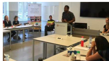
Workshop 'Unpopular Protest?'