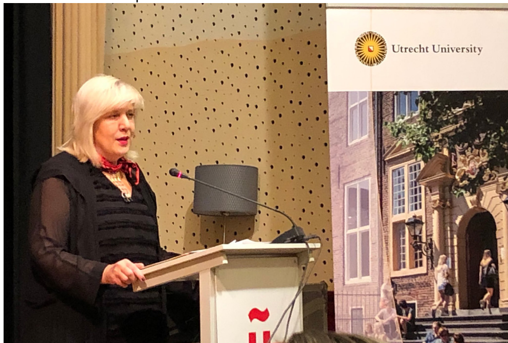
Dunja Mijatović Council of Europe Commissioner for Human Rights