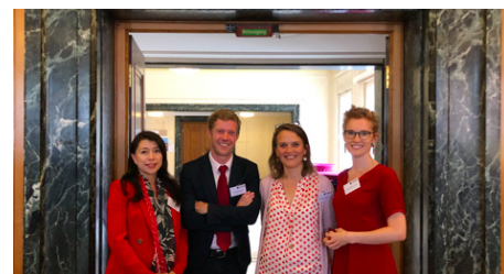
AHRI Conference in Potsdam