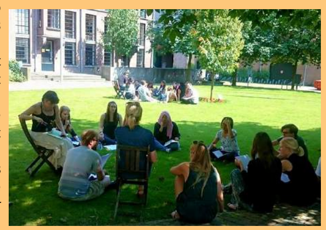
SIM Summer School 2016

the major features of international human rights law, delving into both theory and practice. Participants will analyse specific rights in context, focusing on the complexities around ensuring human rights protection. Participants will also examine the development of human rights law and role played by human rights institutions at all levels of society. Human rights-based approaches for analysing conflict and attempts to promote peace and justice will also be explored. Through lectures, interactive working groups, expert panels, and excursion(s), participants will gain an understanding of the various elements – and their interplay – involved in this field. Applications for the course have now been closed. We're looking forward to welcoming the new students and hearing their perspectives! More information can be found here.