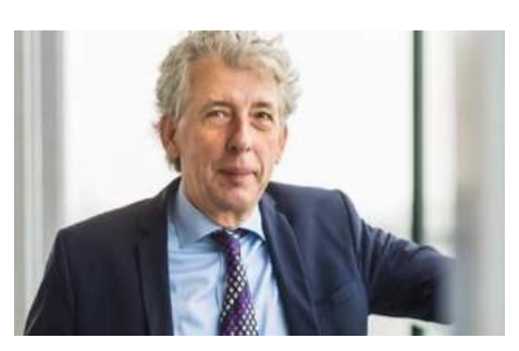
2017 Peter Baehr Lecture