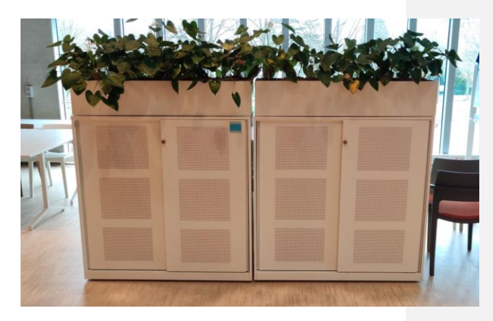
Figure 3 & 4: Cabinets with learning tools

To open these cabinets you will need a key that can be retrieved from the lockbox at the entrance of the Learning Plaza.