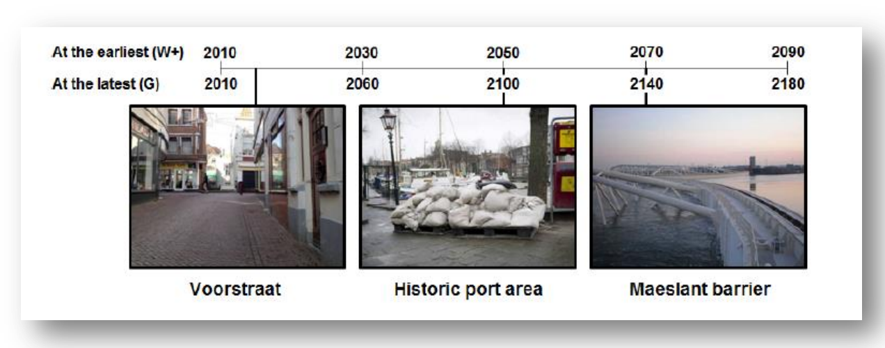
Figure 7: The earliest and the latest climate scenario for the infrastructure of Dordrecht.

In the future, the climate change compromises a sea level rise and as a result, there will be the need for more adequate flood defenses. The costs for these strengthening measures seem to be very high and also sometimes sociably unacceptable. One example of a social unacceptable measure is the reinforcement of the flood infrastructure in the street Voorstraat in the historic center of Dordrecht. Local people disagree in the reinforcement of this structure as its height is totally insufficient to defend extreme flood events. Moreover, a new construction will deteriorate the historic atmosphere of the center. According to future scenarios, the frequency of floods will remain under controllable levels until 2050 (high-climate scenario) (KMNI'06 W+ scenario) while more extreme phenomena will occur in 2100 (medium scenario) / (KMNI'06 G scenario) (Hurk van den, 2007). In the figure 4, we can see the two basic scenarios in the main protection in the island of Dordrecht.